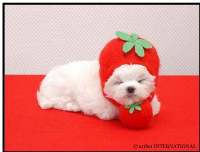
This years Field Day prize