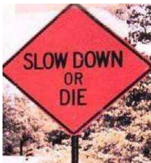
New CW contester sign