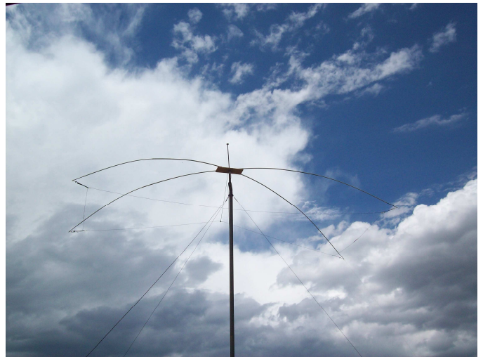
The Moxon finally up