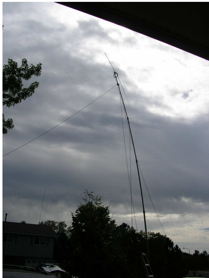
Hamstick 20m dipole for digital station