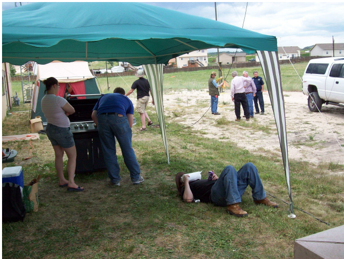
The food crew