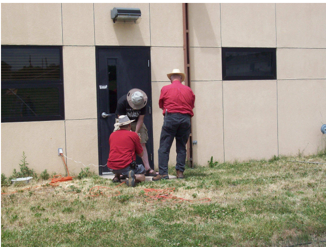
The technical side of Field Day