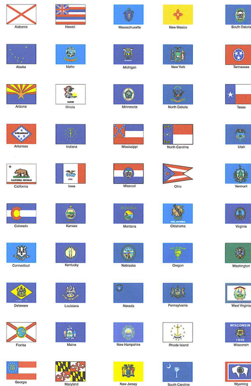
Top Left State QSO Party flags arranged for Avery 5160 label sheet

Note: If you are having alignment problems, please look in the print dialog box and check that the "page scaling" is set to NONE. Other PDF files are made to "Print to Fit". But, when printing to label sheets, no scale should be applied.