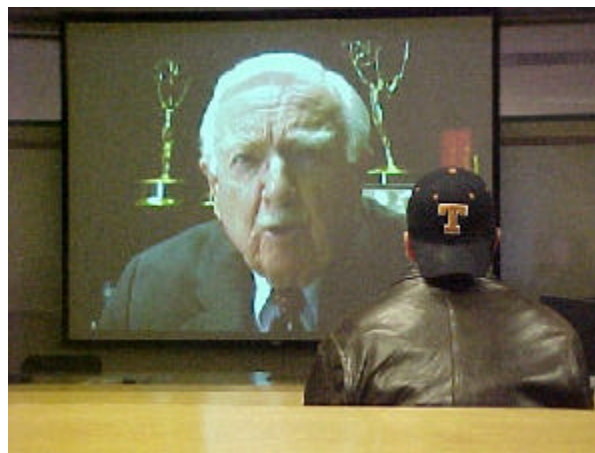
One of the guests.