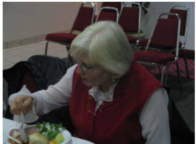
Enjoying some good eats at the Christmas party.