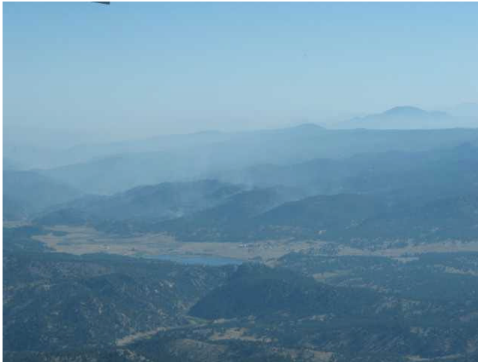
Aerial view of the Hayman Fire.

"I wish to thank each volunteer for the time, personal resources, and energy that you expended in support of the various missions associated with the Hayman Fire. Because of your efforts, firemen and evacuees were fed excellent meals in a timely manner. Those who used the ARC shelters at Lake George and Woodland Park had additional comfort and support. Fire fighters and residents at West Creek Fire Station had communications to the outside world. The Teller County Sheriff's office could communicate with West Creek Fire. The Colorado Springs Salvation Army Director was able to have instantaneous communications both in the office and in the field. The Woodland Park Police Department had access to all the facilities that were covered by our operators. All these things YOU made possible ... these and many others that you did that were above and beyond the call of the duties that we were in place to perform."