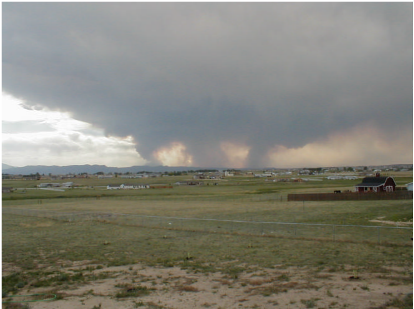
An incredibly large smoke plume, coming from several shafts, rises from the re-born fire as it jumps across Hwy 67 and heads east to Rampart Range. take from 1.5 mi E of Falcon on 6/18.

You can get a pretty good idea of the chronology of the events if you review the numerous e-mails archived on line at http://mailman.qth.net/pipermail/ppares/