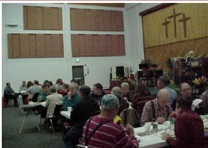
PPRAA members enjoy a fine Christmas dinner of ham and turkey at the Springs City Church at the PPRAA Christmas Party. If you didn't make it, you missed some downright good food! Well, there's always next year!!